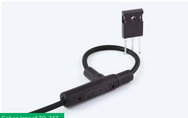
Coil on legs of TO-247

The CWTMini50HF offers a 50MHz (-3dB) bandwidth utilising a novel shielded clip-around coil of 100mm circumference and 3.5mm cross section diameter. The shield improves the performance of the current measurement in a circuit where the coil is exposed to fast dV/dt transients; e.g. when measuring rapid current transients in a semiconductor device with a high blocking voltage.