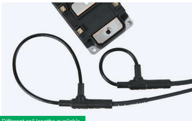
Different coil lengths available