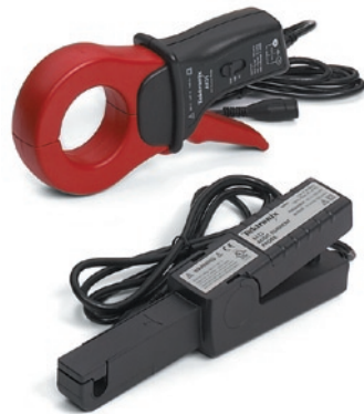
Illustration shows high performance current probes from Tektronix Inc.

Normally the probe provides a method of mechanically splitting the magnetic circuit to enable the conductor to be inserted. The position of the conductor within the loop has relatively little effect upon the measurement.